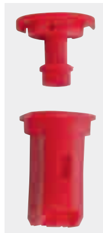
Toolless removable injector