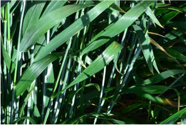
Alvius – wide leaf