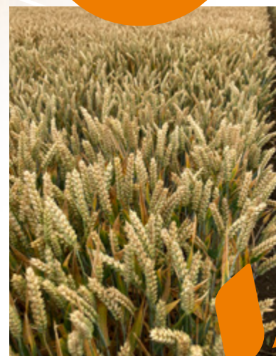
Mindful, Bedale Yorks. Harvest 2022

Mindful has a sound combination of disease resistance ratings, suggestive of multi-gene protection derived from the parents of Evolution and Costello. The latter is renowned for its high specific weight and Mindful carries this trait too, while Costello's total resistance to yellow rust, from the single Timaru gene is only part of Mindful's genome, promising similar stability over time.