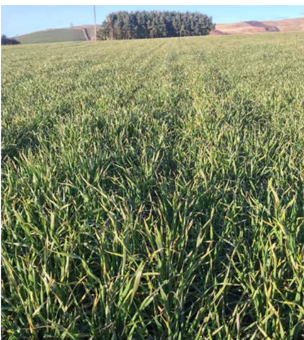
800ft above sea level Scottish Borders – 8 March 2021